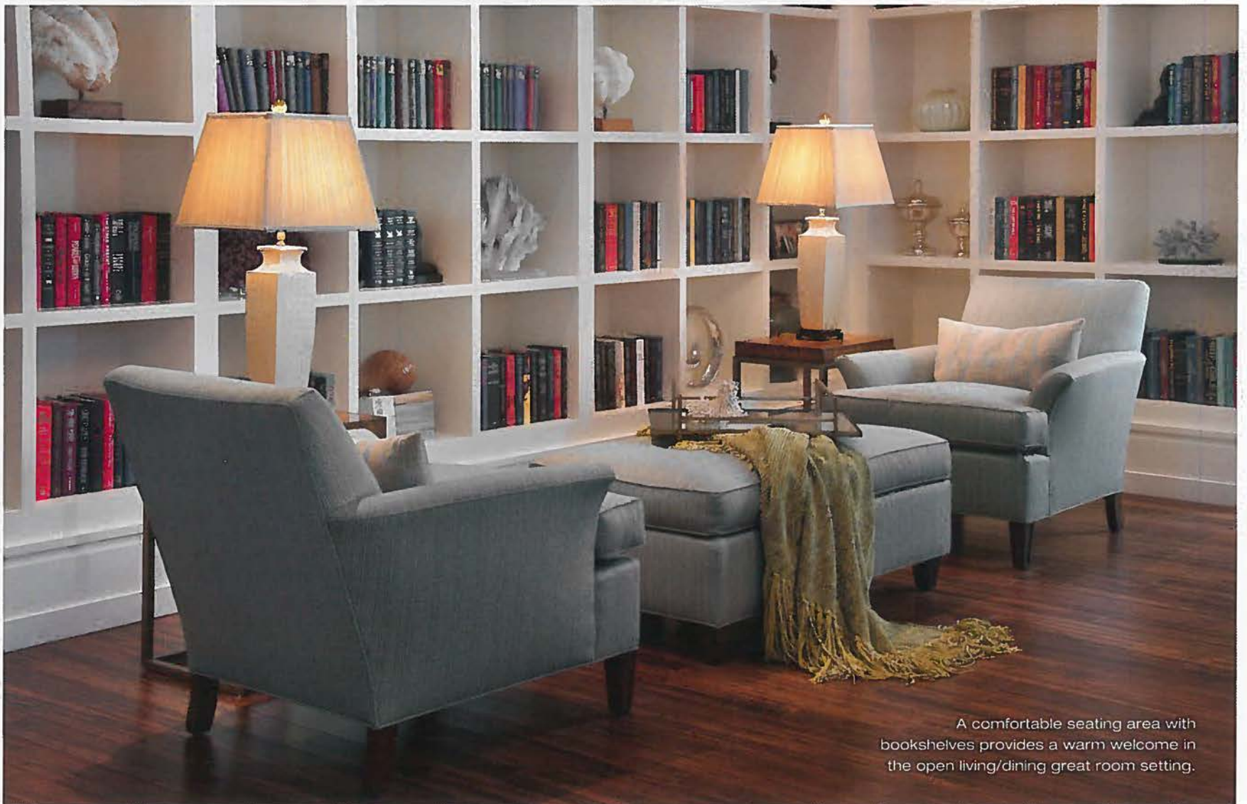
A comfortable seating area with bookshelves provides a warm welcome in the open living/dining great room setting.