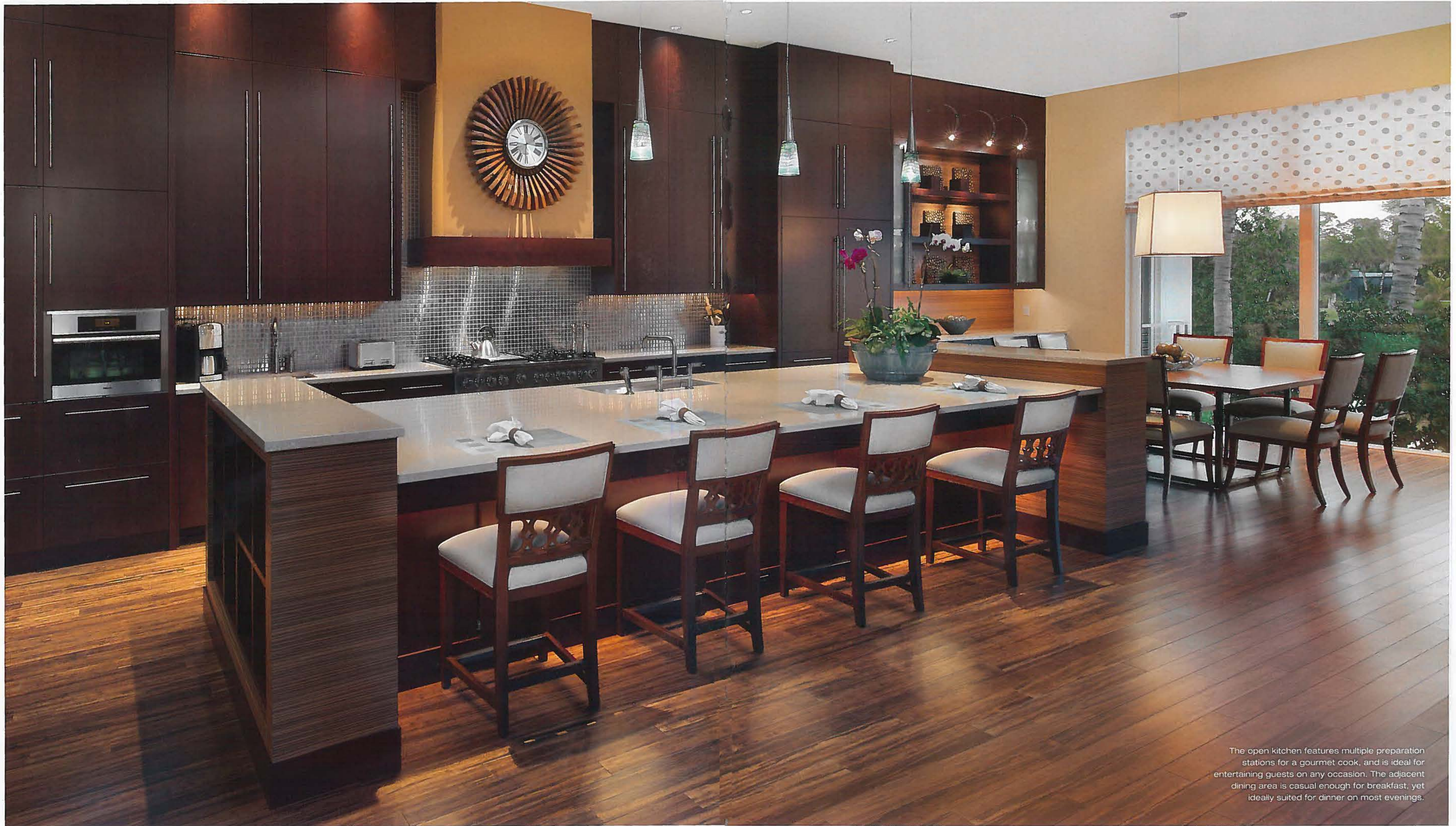
The open kitchen features multiple preparation stations for a gourmet cook, and is ideal for entertaining guests on any occasion. The adjacent dining area is casual enough for breakfast, yet ideally suited for dinner on most evenings.