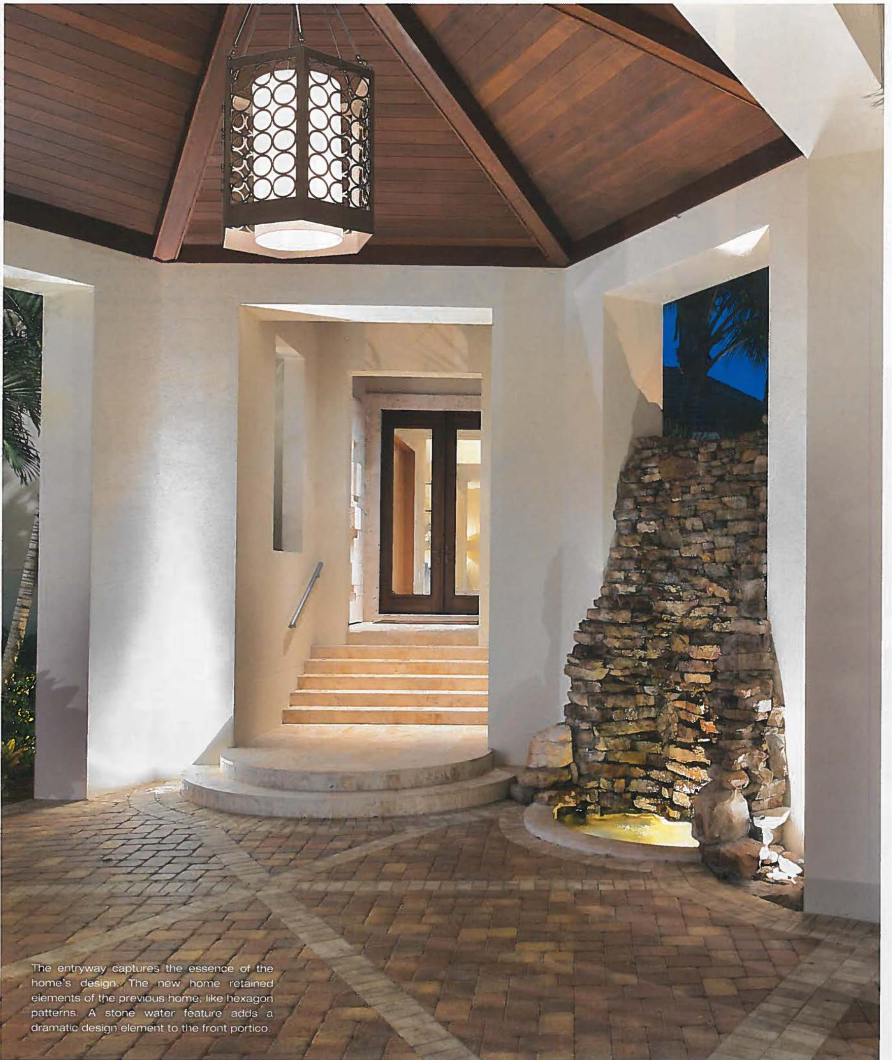
The entryway captures the essence of the home's design. The new home retained elements of the previous home, like hexagon patterns. A stone water feature adds a dramatic design element to the front portico.